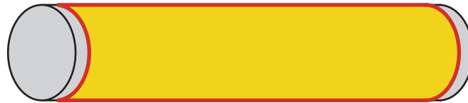
placement on roll